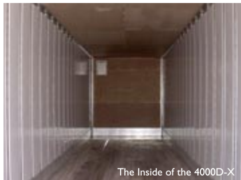
The Inside of the 4000D-X