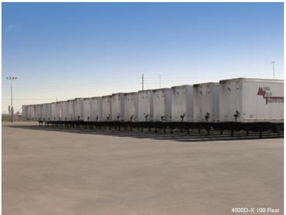
4000D-X 100 Fleet