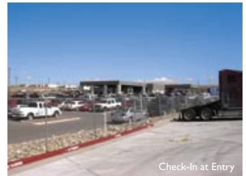
Check-In at Entry