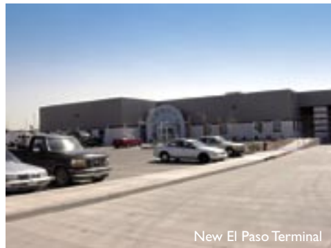
New El Paso Terminal