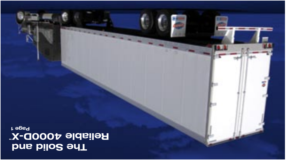
The Solid and Reliable 4000-D-X™ Page 1

The Quarterly Publication for Top Utility News