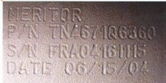
New engraved identification