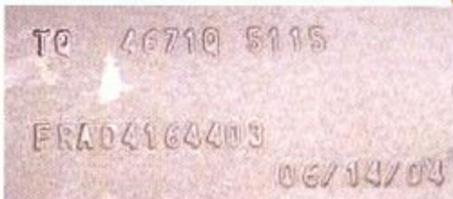
Current aluminum Tag